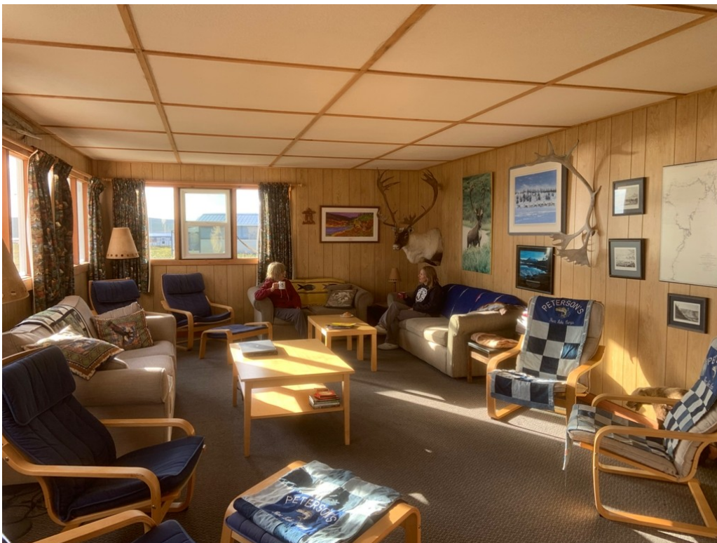
Enjoying a morning coffee in the caribou corner inside the updated guest lounge.

Some of the improvement maybe more easily noticed behind the scenes that will help us with storage, organization and efficiencies, the end result, to provide a more comfortable and streamlined experience. We trust you'll enjoy our more spacious lounge now that our tackle shop has its own stand alone building and the improvements we've made.